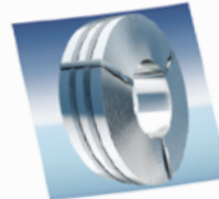
Brockhaus also produces slit strip in its own cold rolling mill.

»It is not merely efficiency and rapid revenue gains that is decisive in the manufacturing of steel products but rather it is quality that ensures sustainable entrepreneurship.« Hermann Brockhaus, 1927