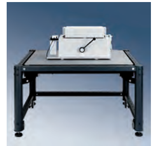
Magnetostriction tester with vibration-free table