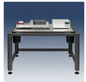
Magnetostriction tester for amorphous material