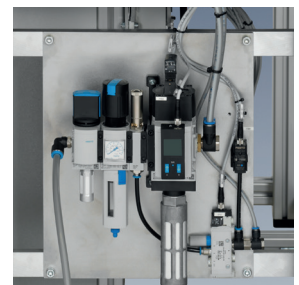
Detail of stacking factor