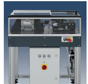
Stacking factor tester