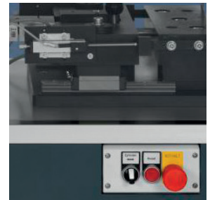
Length measuring sensors