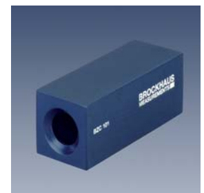
Zero field chamber BZC 101